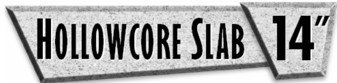
14" x 4'-0" HOLLOWCORE SLAB